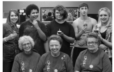
Women of the GFWC bring Birthday cupcakes once a month!